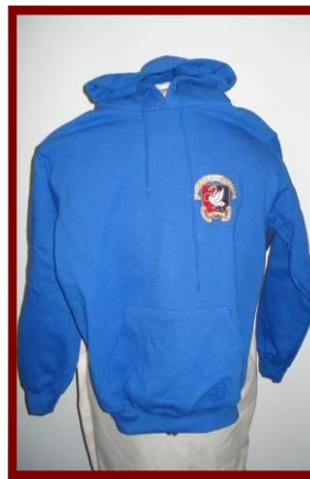
Hoodie (80% cotton, 20% acrylic) with school logo on left breast.