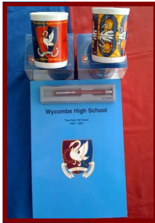
Bone China Mugs, Parker Roller Ball Pen, 'The First 100 Years of WHS'.